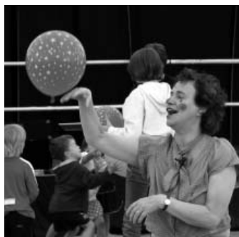
Tuesday highlights: (from left top) A 'touching' moment in the team meeting; craft tent; a Lighthouse (small group); down training sessions