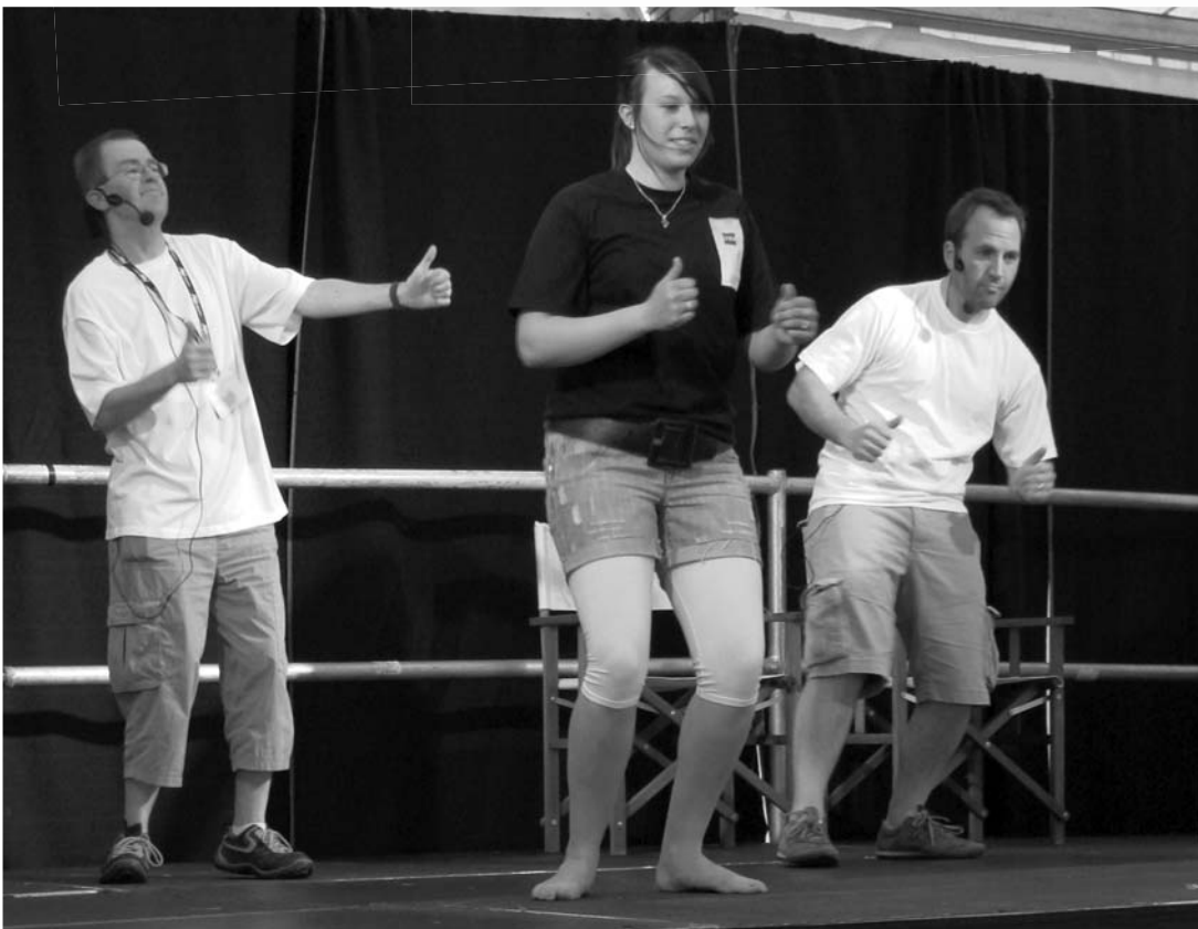
The mainstage team teaching the week's dance at Sundays Commissioning Service. (Try to keep up boys!)

Tuesday 29 July 2008 • Lighthouse Thame 2008 • www.lighthousehame.org.uk • 07722 08895