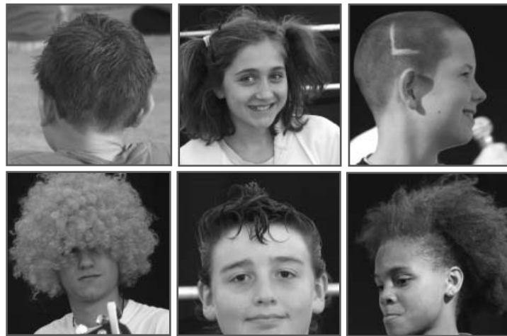
Wednesday's Lunch Box Challenge: Crazy hair!