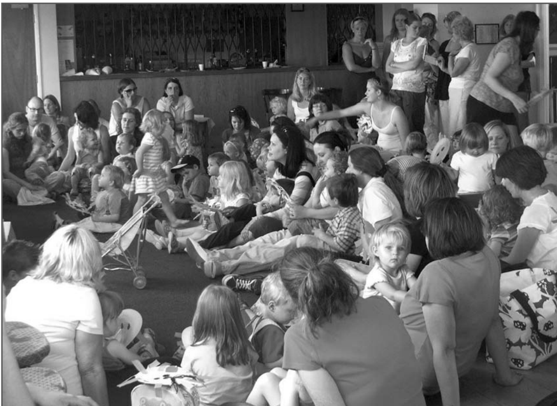
Lighthouse Parent & Toddler session listening to the mainstage team at the Rugby Club

Thursday 31 July 2008 • Lighthouse Thame 2008 • www.lighthousehame.org.uk • 07722 08895