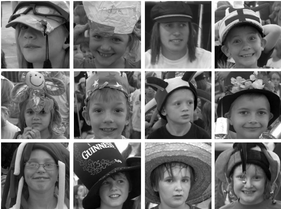
Thursday's Lunch Box Challenge: crazy hats

Friday 1 August 2008 • Lighthouse Thame 2008 • www.lighthousehame.org.uk • 07722 08895